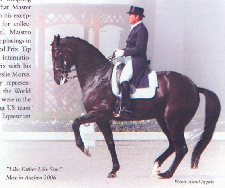
"Like Father Like Son" Max in Aachen 2006

Both Max and Tip Top played a large part in the Swedish Warmblood's success in achieving the 4th place in the World Breeding Ranking in 2006. Master himself is one of the Top Ten Dressage Sires in the World based on the FEI World Breeding Rankings for Dressage Horses 2006 ( published in Horse International March 2007 ).