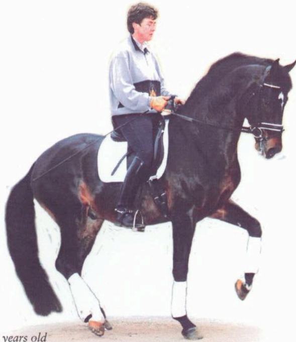
Master 6 years old